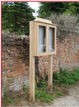
Parish Notice Board