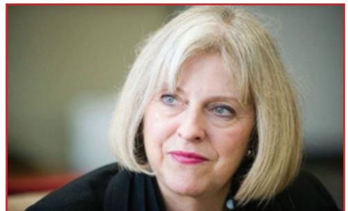
Theresa May, MP for Remenham