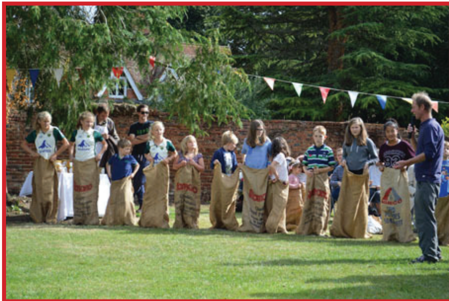
Remenham Autumn Fayre