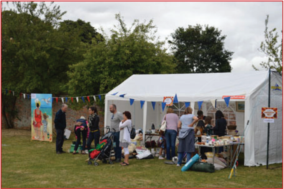
Remenham Autumn Fayre