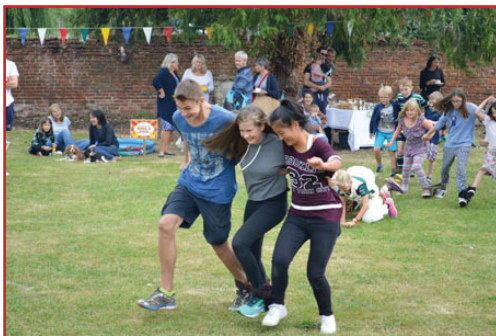
and one of the congregation during the Rewind Festival in August!