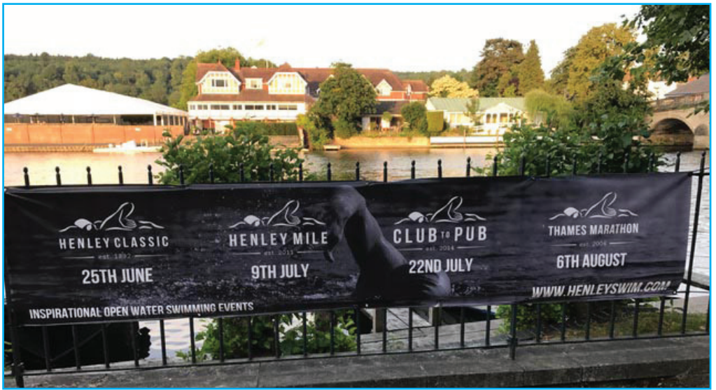
The Henley Swims banner, with the river and Leander in the background