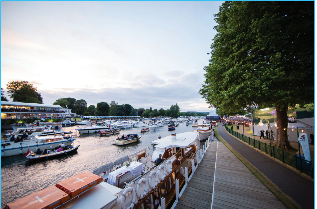
The towpath in Remenham during The Henley Festival 2016