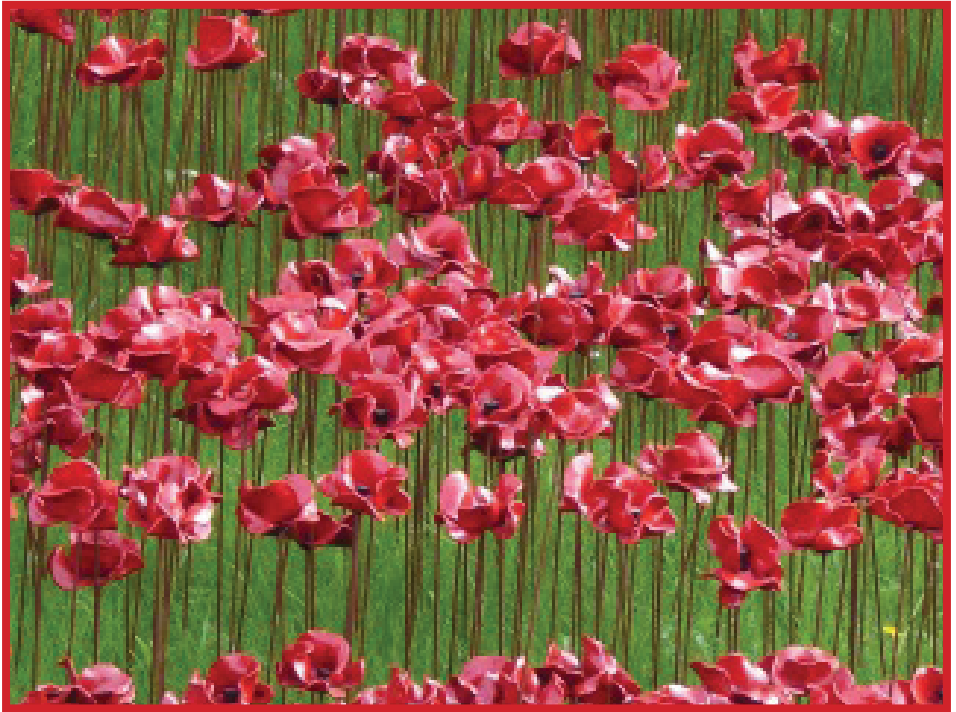
Photograph of the poppies at The Tower of London 2016