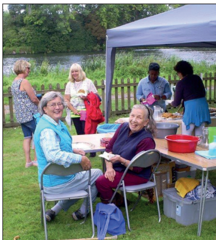
Refreshments in Old Blades' garden during Rewind Festival last year