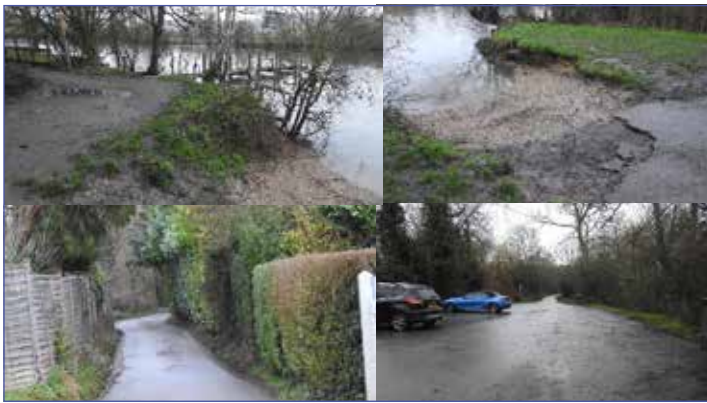
Figure 1. Ferry Lane, Aston where remedial slipway work, work to widen the narrowest sections and new WBC-enacted parking is proposed