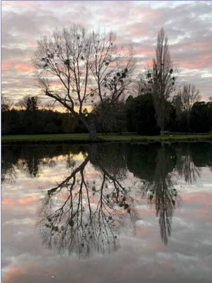
Tree Reflection