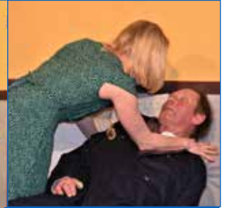
Some highlights from The Remenham Thespians' recent production