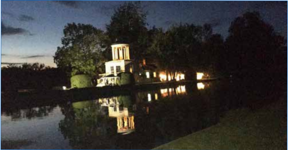
Remenham Photographer - Jeanette Brown