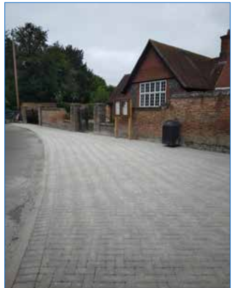
The wonderful block paving - at last

Another long term challenge for your council has been to keep up to date on Gigaclear progress. I spoke with their build team again today and am advised that supply delivery is imminent. If you are interested please log your details on the Gigaclear website.