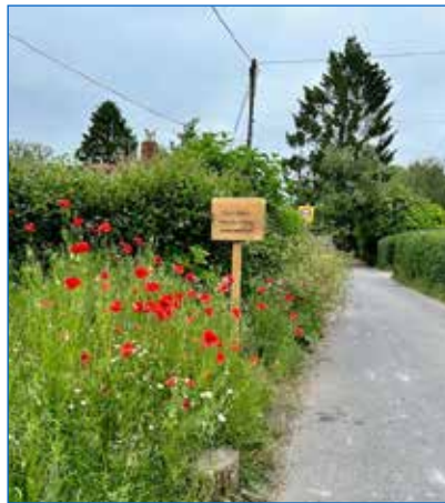
One of the new signs in Ferry Lane