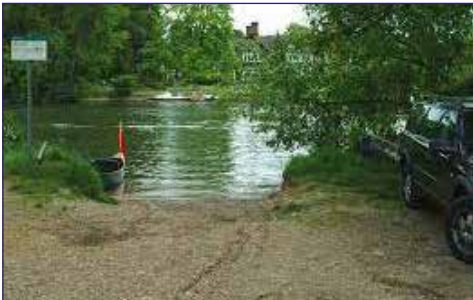
Ferry Lane Slipway (see next page)